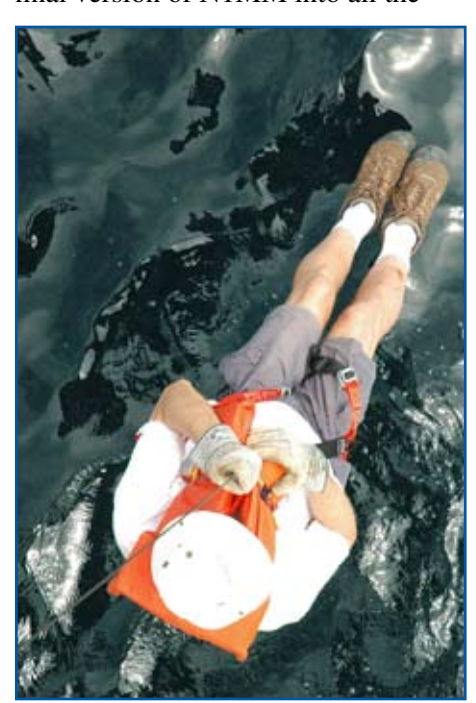
K4UEE, going up the easy way.

While Gregg, W6IZT, loaded the final version of N1MM into all the