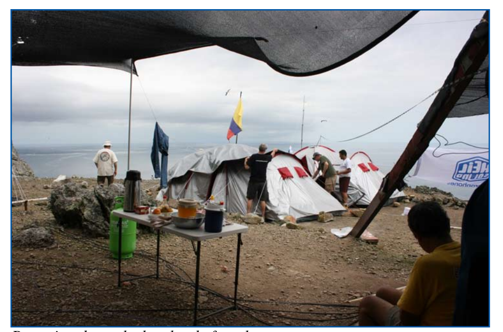
Battening down the hatches before the storm.

Op. A was shut down on 3 February and everything was brought down the mountain. It was sad in a number of ways, as their success was critical