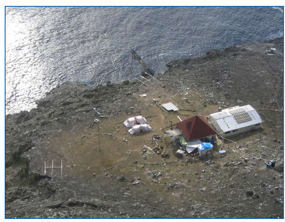
Looking down on to operating site B.