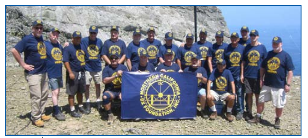
The HKØNA team.