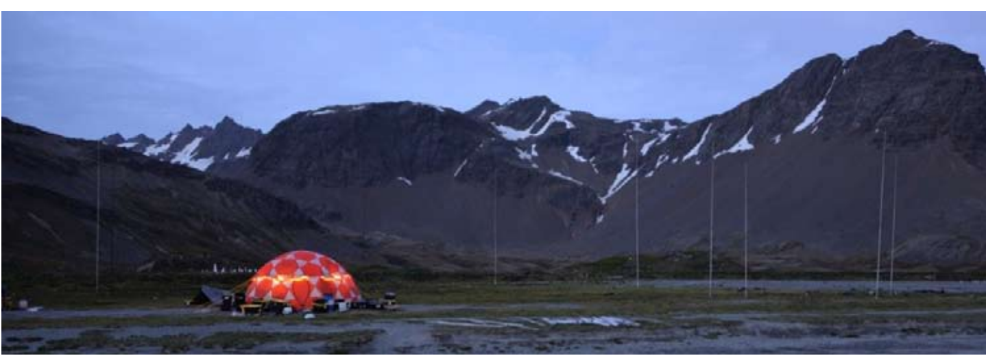
80M two-element array, 40M 4-square and 160M two-element array and spare aluminum at VP8SGI.

Working VK and ZL was a challenge at these two sites since we had to rely on paths through the polar absorption regions that were activated and subsequently disruptive to radio circuits as a result of the effects of recent solar ejecta. With the improved conditions and mild weather, the QSO rates that were produced on South Georgia exceeded