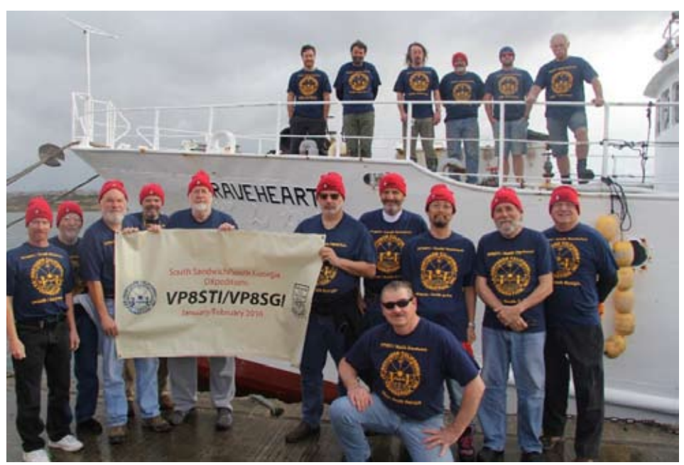
73 from the VP8STI/VP8SGI team and the Braveheart captain and crew.

I am often asked if this will be that last time I get on a boat for a long ride and my current answer is "Not any time soon."