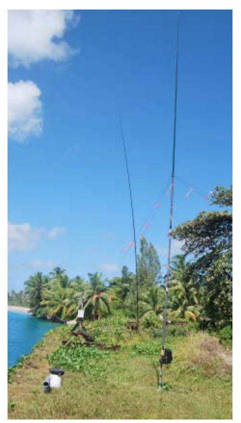
West SteppIR BigIR and 80M Spiderpole vertical in background.

After a mandatory briefing by TNC on rules and how the camp operates, we quickly threw our belongings into our assigned cabins and headed to the Dry Lab and wharf area to begin our deploy-