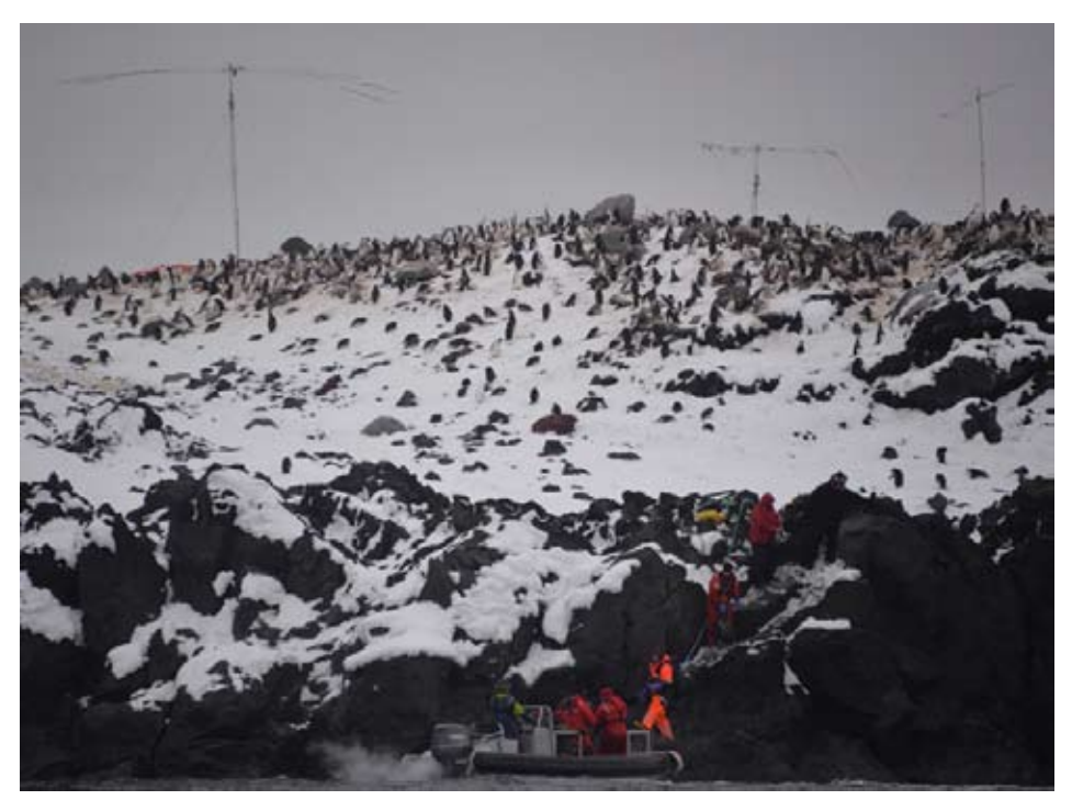
Moving material up the rock-faced cliff at VP8STI.

two gentlemen spent endless hours over the two years while preparing for this trip.