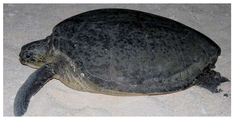
One of the local island residents.

on the north shore, 500 feet from the landing site, to be optimal; not only for propagation to the north, but the steep slope of the shore would minimize impact on nesting turtles. Making 20 trips in the small dinghy and carrying two tons of gear over the difficult 500-foot expanse of sand was difficult and the soft, white sand added to the sun's intensity. Despite several applications of SPF 50 sunscreen, many team members found themselves sunburned on the first day.