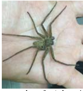
Some of the island's fauna: coconut crab (which can grow up to three feet), hermit crab and king spider.