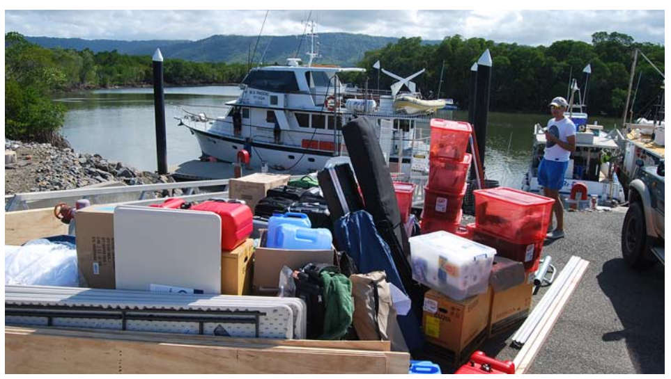
Would all of our gear fit on board the Phoenix?

designed to have nearly identical equipment and support for all modes — CW, SSB and RTTY — which enabled any team member to operate at any station with minimal adjustments and configuration.