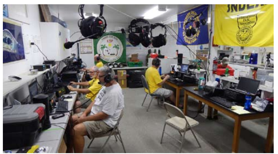
The operating positions in the Dry Lab.

We had an SAL-30 receive array, which we initially put up near the Dry Lab, but there was a lot of desense and noise picked up from laboratory equipment. We were able to move it 800 feet further and found that location extremely quiet! Without this antenna we would not have had the success we had on 160M and 80M. We had the usual tropical QRN, but surprisingly little in the way of local