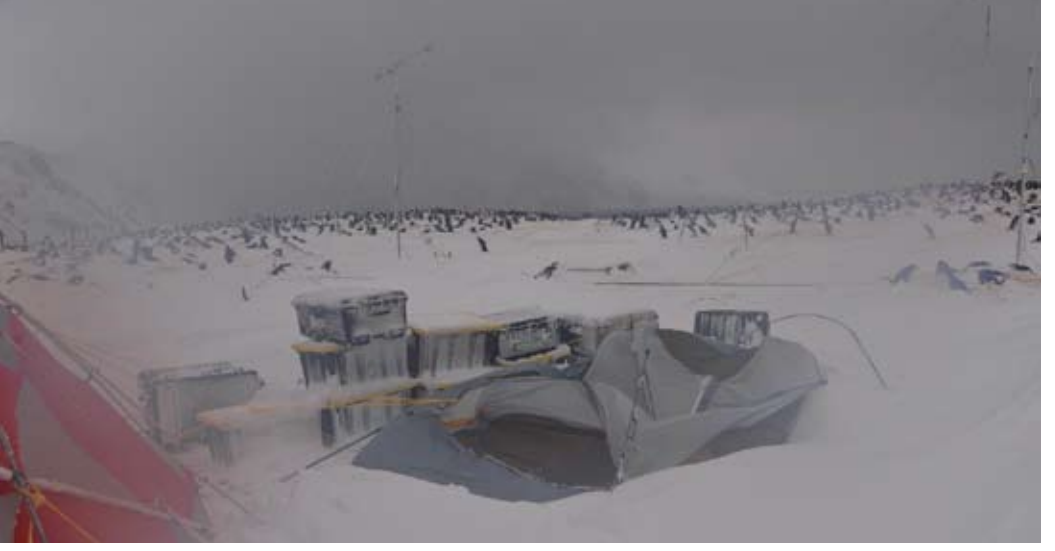
VP8STI following the storm on 24-25 January with the Bio Station tent and a second sleeping tent buried under the snow.

museum in Grytviken, inspecting the many artifacts from the whaling.