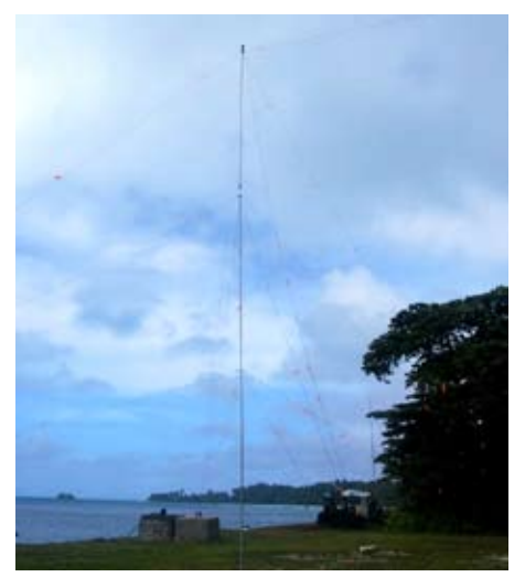
The 22-year-old Battle Creek Special. World record holder for ups and downs!

Upon arriving at the terminal we had a mandatory briefing by USFWS followed by a pilot briefing. After which we were told that, with the checked bags on board, there was no more room for our carry-on