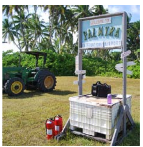
Palmyra International Airport terminal.